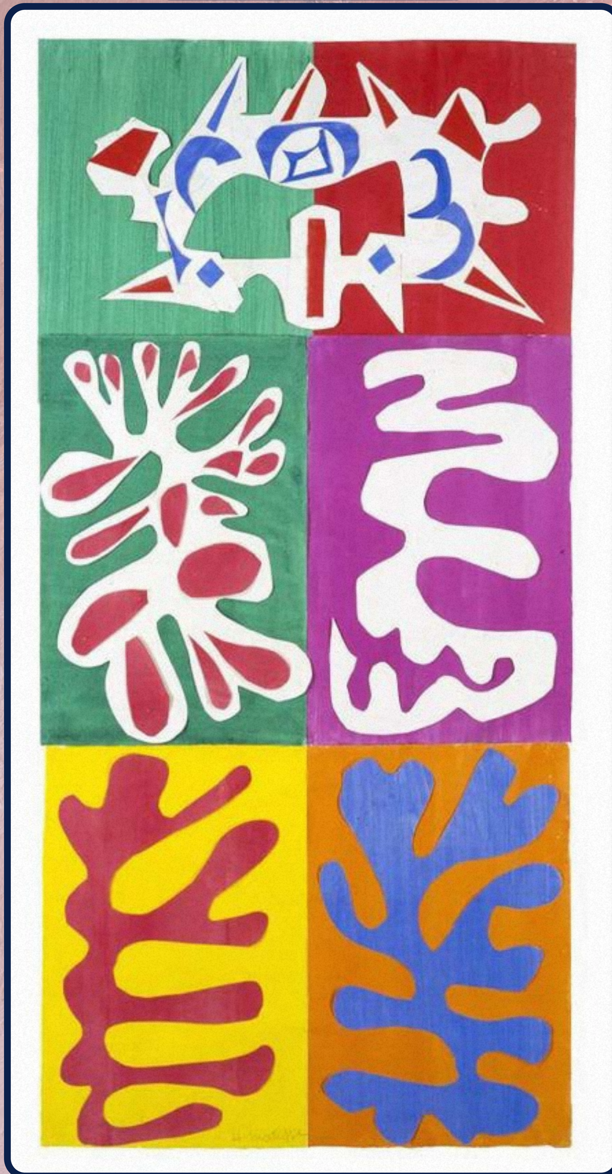
Panel with Mask (1947)