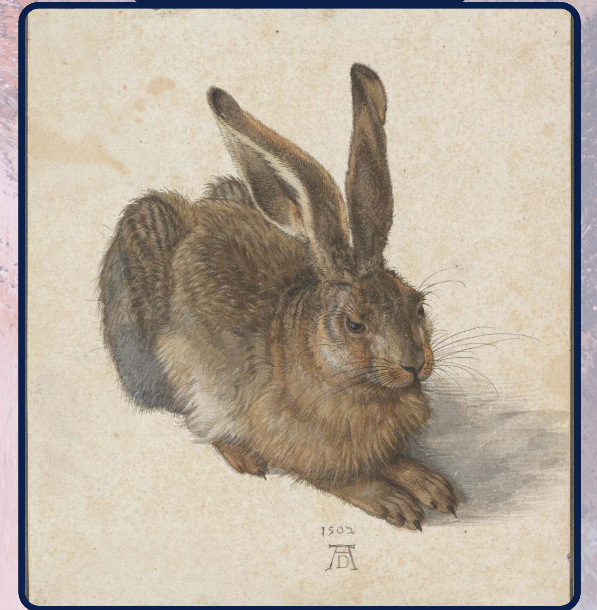
Young Hare (1502)