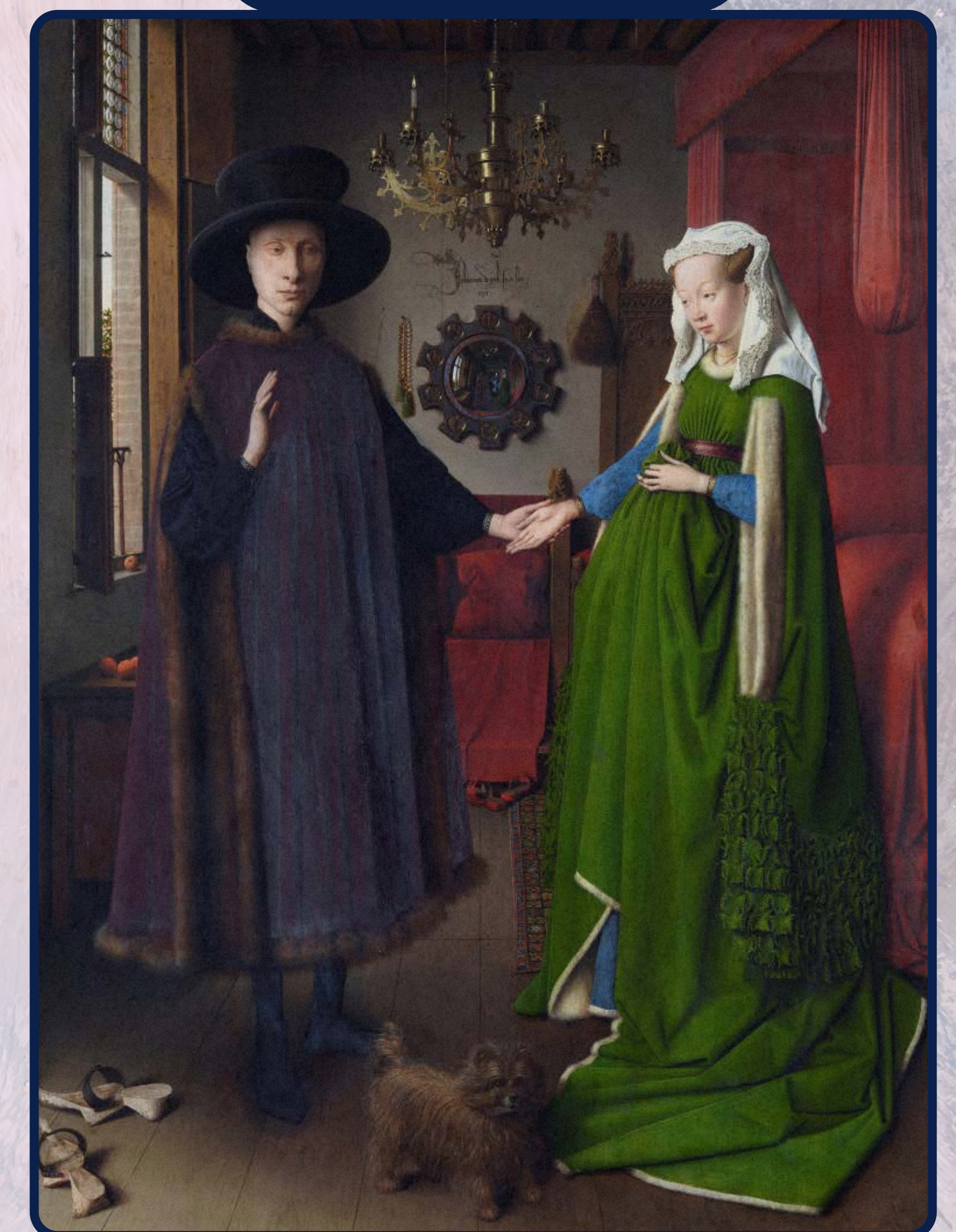
The Arnolfini Portrait (1434)