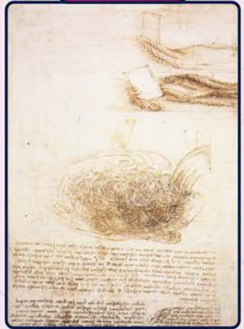
Studies of Water (1508-1509)