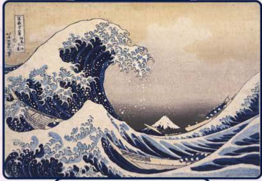
The Great Wave (1829-1833)