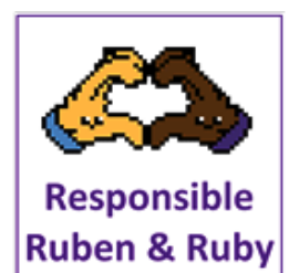
Responsible Ruben & Ruby