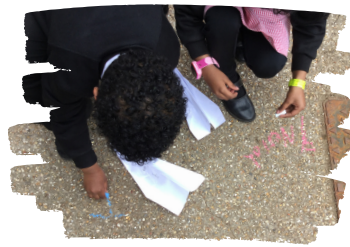
Above are year 5 children investigating angles using a protractor.