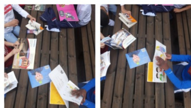
Year 3 reading in the garden centre