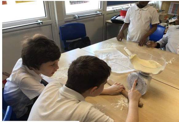
Year 5/6 were cooking this week in DT, Food Technology.