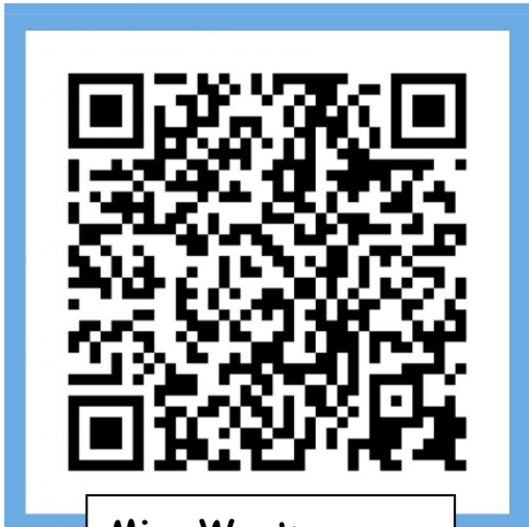
Miss Weetman Year 3

Please download the Seesaw app and use the QR code provided to access your child's class communication page. This will be used alongside marvellous me.