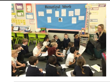
Parents / family came into school to share books with their children and children dressed as their favourite book character.