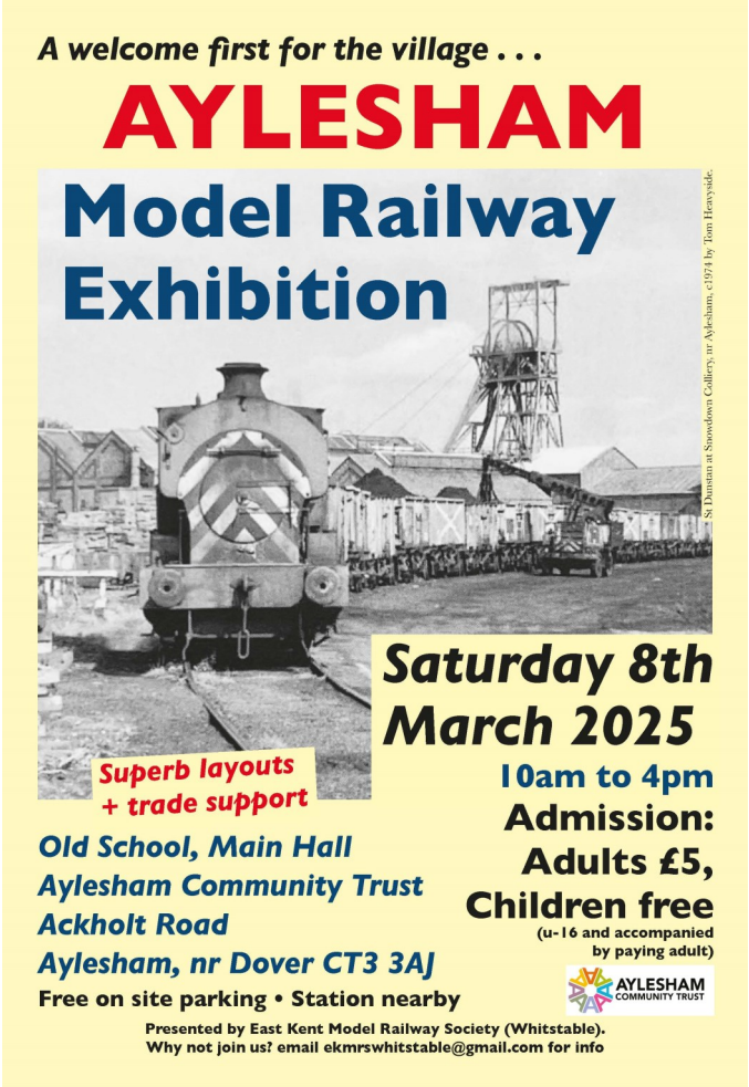
St Dunstan at Snowdown Colliery, nr Aylesham, c.1974