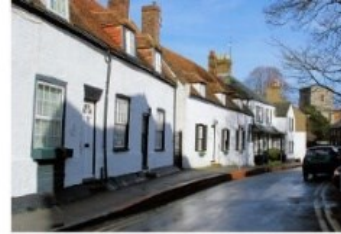
Working for the Residents of Eastry