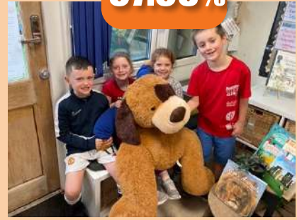
Well done YEAR 3 for great attendance this week! Chip is looking forward to accompanying you in class again next week.

You haven't got long until Christmas... Your orders and artwork must be in soon