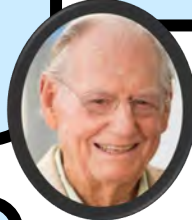
Scientist: Bernard Palissy