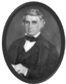
Half Term Scientist William Beaumont (1785-1853)