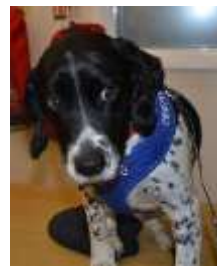
Maisie Therapy Dog