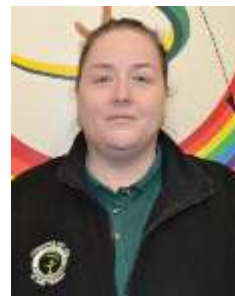
Keeley Speech and Language support