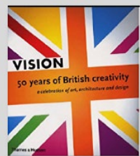
50 years of Creativity