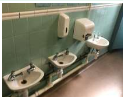
Don't forget to wash your hands

We have 2 sets of toilets in the Reception classroom. You can go whenever you need to, but don't worry if you have accidents as we will help you. Always remember to wash your hands after using the toilet!!!!