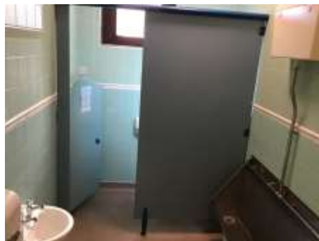
Don't forget to flush!!