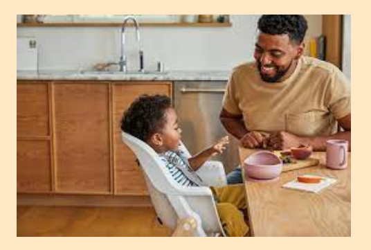
NARRATE YOUR DAY. WHETHER YOU ARE MAKING DINNER OR DOING THE LAUNDRY. TALK ABOUT WHAT YOU ARE DOING.

WITH YOUR LITTLE ONE SITTING RIGHT THERE IN FRONT OF YOU IT MAKES IT A PERFECT TIME FOR THEM TO WATCH, LISTEN, AND LEARN WHILE YOU TALK.