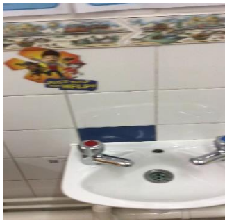
Don't forget to wash your hands

We have 3 toilets in the Nursery classroom. You can go whenever you need to, but don't worry if you have accidents as we will help you. Always remember to wash your hands after using the toilet!!!!