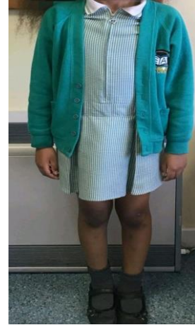
Girls can wear: White polo shirt/blouse Endeavour jumper or cardigan Green & white dress Grey pinafore dress Black shoes

This is your school bag, where you can keep your belongings including your library books. You bring it to school every single day.