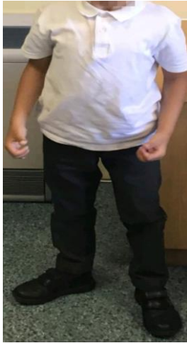
Boys can wear: White Polo Shirt/Shirt Endeavour Jumper Grey Trousers Black Shoes