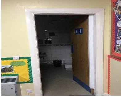
Toilets for boys and girls