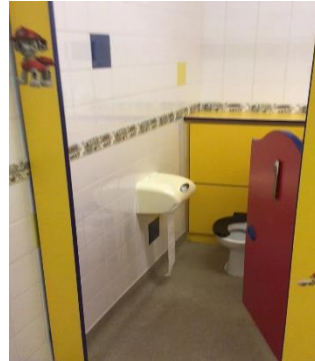
Don't forget to flush!!