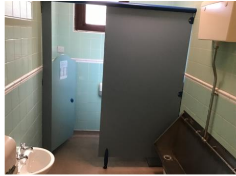
Don't forget to flush!!