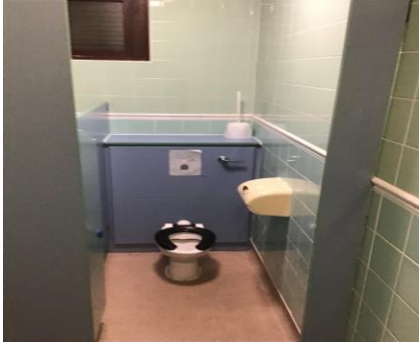
Toilets for boys and girls