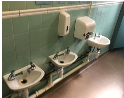
Don't forget to wash your hands

We have 2 sets of toilets in the Reception classroom. You can go whenever you need to, but don't worry if you have accidents as we will help you. Always remember to wash your hands after using the toilet!!!!