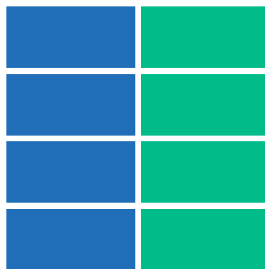
10 out of 20

Can you create at least 10 ways to show the fraction that you have chosen?