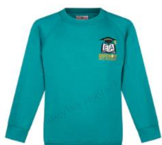
Sweatshirt with school badge

Please find below a detailed uniform list outlining the uniform expectations at Endeavour Academy: