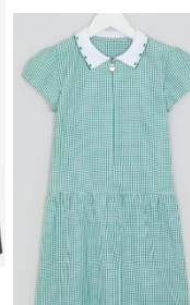
Green gingham dress (optional for Summer)