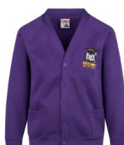
Year 6 Cardigan with school badge