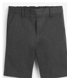
Grey /black short (optional for Summer)