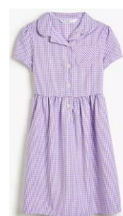
Year 6 - purple gingham dress (optional for Summer)

Children must only wear plain black, grey or white socks/tights .