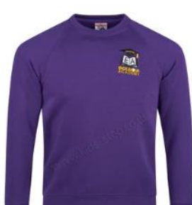
Year 6 sweatshirt with school badge