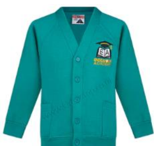
Cardigan with school badge