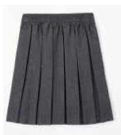
Grey/black knee length skirt