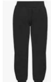
Black jogging bottoms (optional for winter)