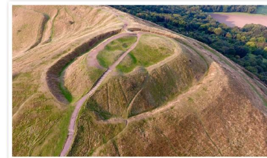
Iron Age hill fort discovered by archaeologists

People began using iron to make weapons and tools. Iron was cheaper, stronger and lighter than bronze. During this time, many Celtic people from Europe settled in Britain. People now lived in tribes and fought against each other for land and goods. Hill forts were built for defence. People lived inside the forts and warriors defended them against enemy attack. Towards the end of the Iron Age, some larger fortified towns appeared. The Iron Age ended in AD 43 when the Romans invaded and settled in Britain.