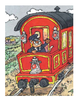
Unit 4 Day 1