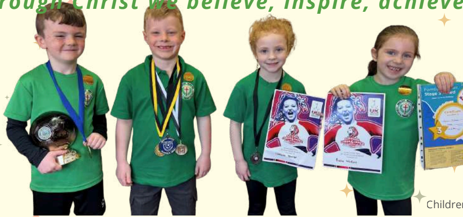
Children with Good News

Through Christ we believe, inspire, achieve.