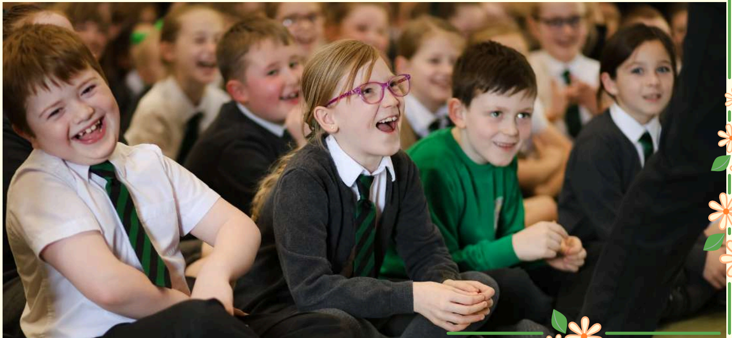
Laughs in assembly