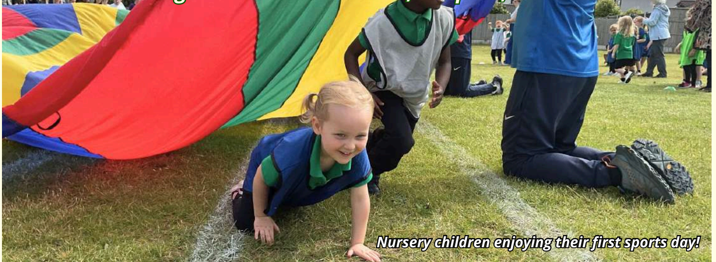
Nursery children enjoying their first sports day!

Through Christ we believe, inspire, achieve.