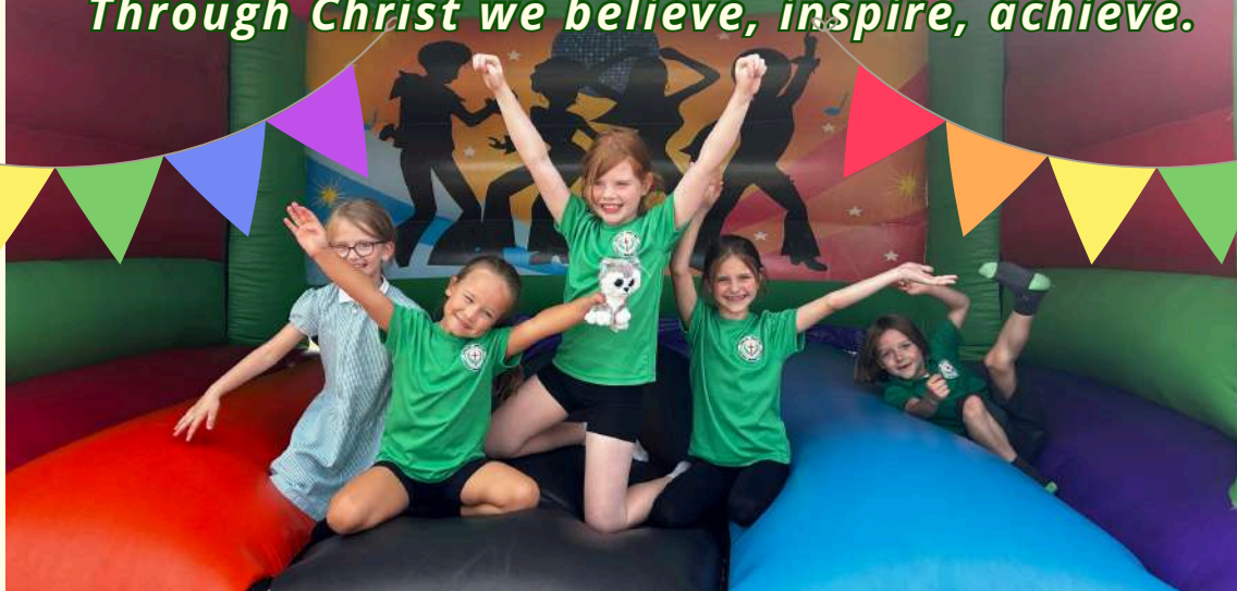
Year 2 enjoying the bouncy castle

Through Christ we believe, inspire, achieve.