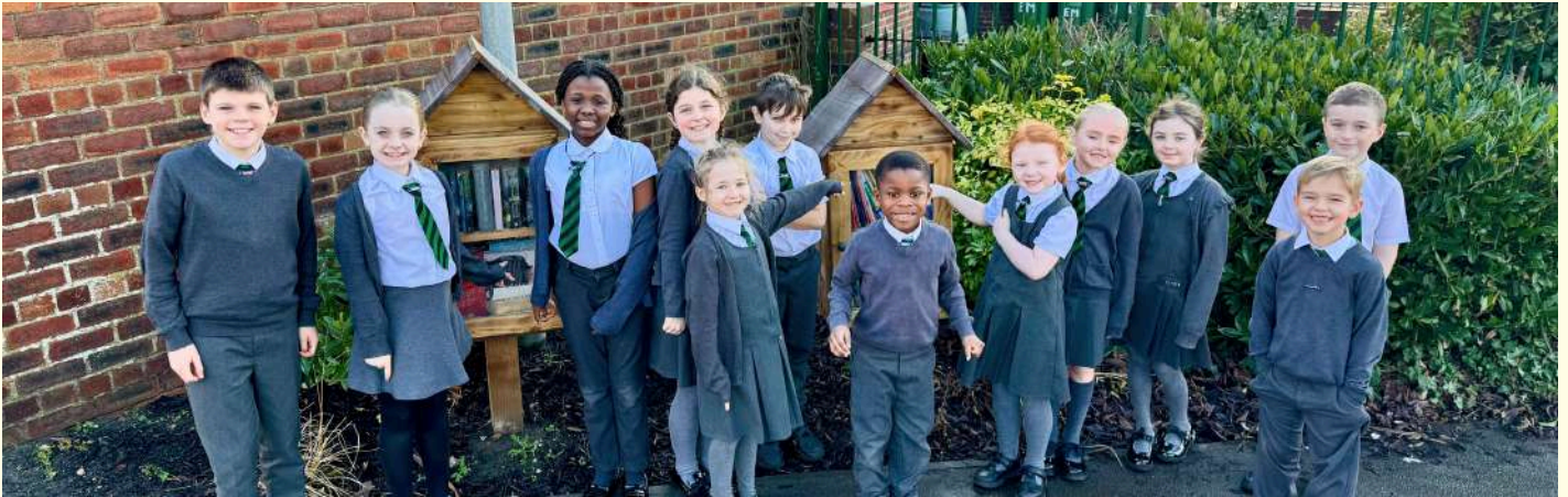
Our Reading Champions showing everyone where our book donation stations are!