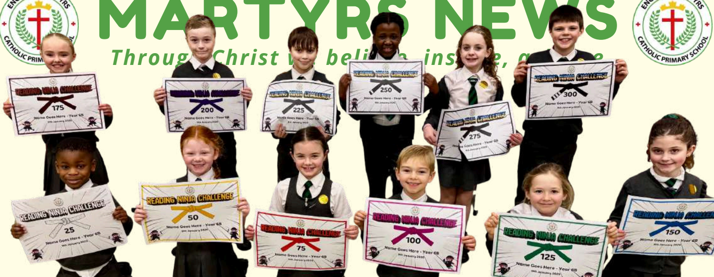
Reading Champions showing the Reading Ninja belt certificates