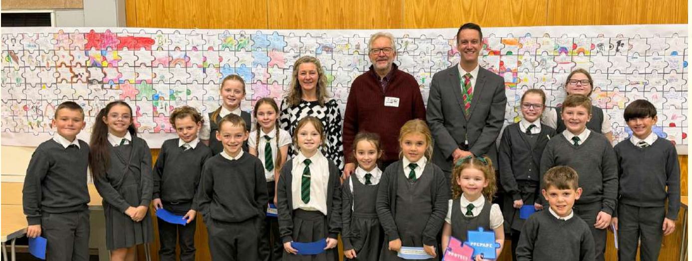
Send my friend to school

FRIDAY 17TH NOVEMBER 2023 | NEWSLETTER 5