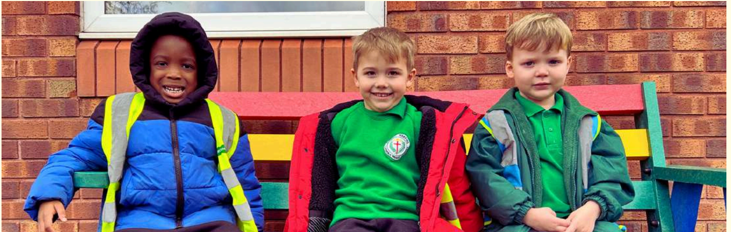
Nursery boys on the buddy bench

Friday 7th February 2025 - Newsletter 10