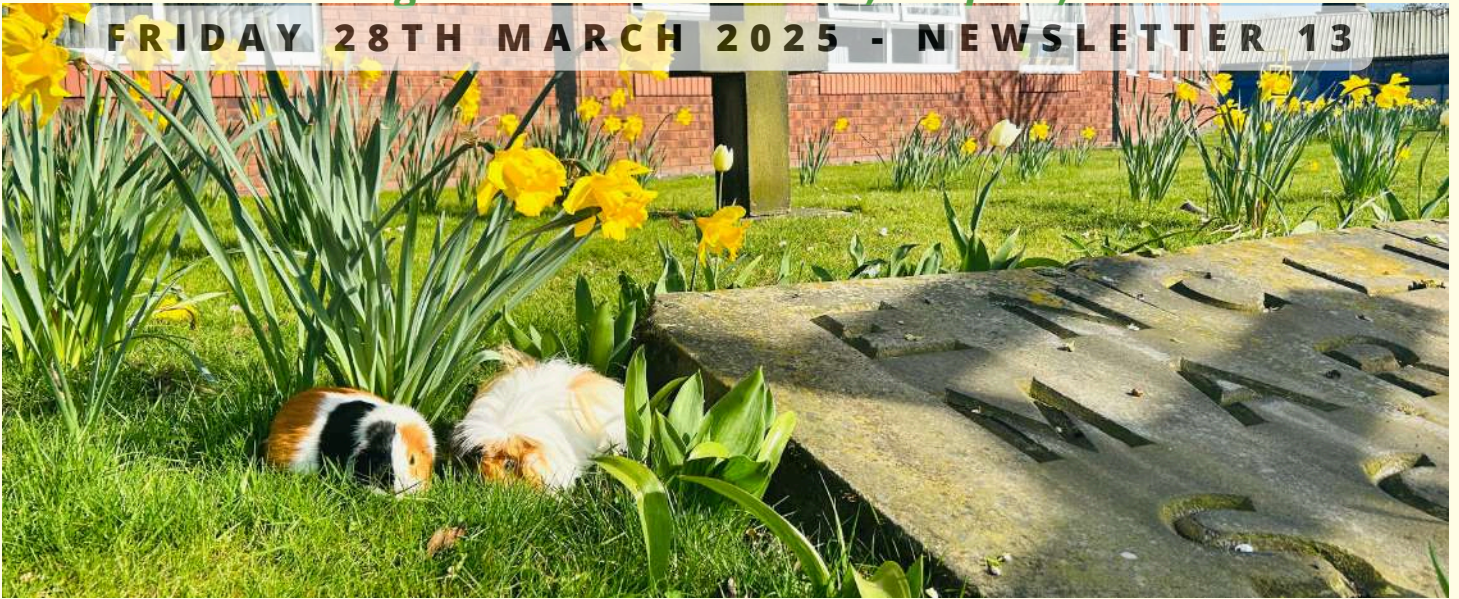
Moo & Lucky enjoying Spring!