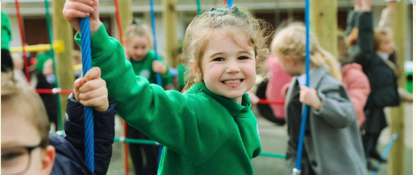
Enjoying the new playground equipment!