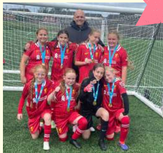
County Champions 2025