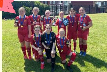
Champions Cup and League Champions