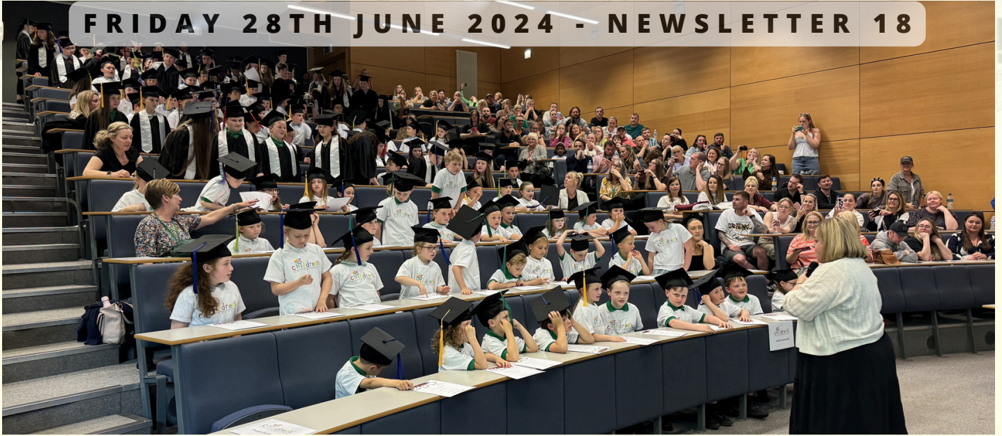
Sefton Children's University Graduation for Year 2 & Year 6