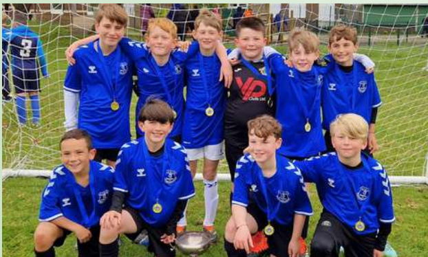
Y5 Boys team: Faye Cup Winners, EFC tournament Winners.