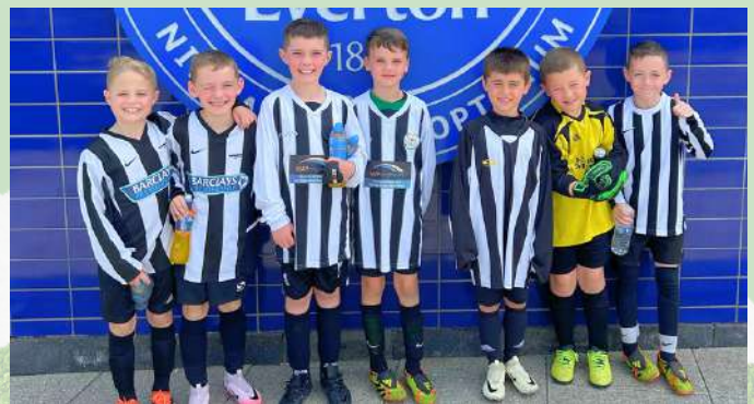
Y3 Boys Team: EFC tournament WINNERS at local - semi finalists regional.