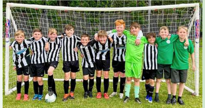
Y6 Boys team: Division 2 Champions, Peter Dowd Cup winners, Griffiths Cup semi-finalists.