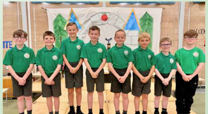
Y4 Boys team: EFC tournament 2nd place.