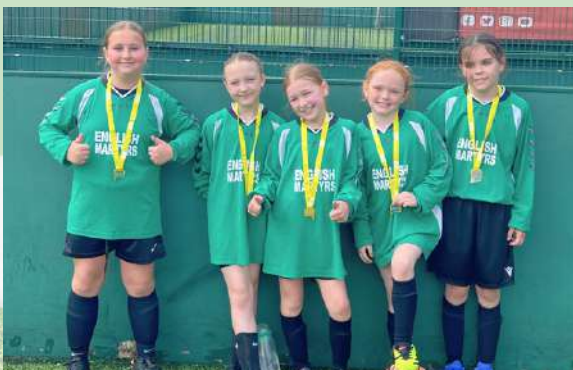
Y3/4 Girls Team: Euros tournament Winners.