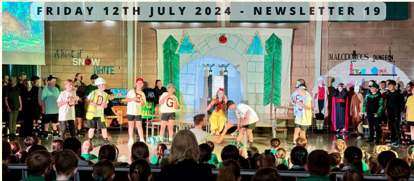
Year 6 Summer Production - 'A Hint of Snow White'