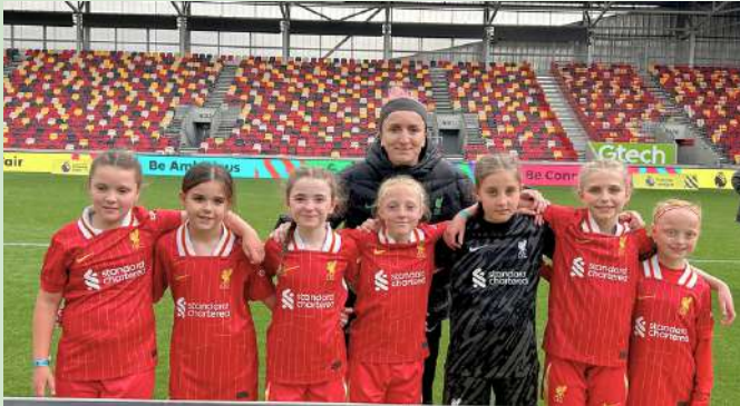
Y5/6 Girls Team: Division 2 Winners, Champions Cup Winners, LFC Primary League Winners, finalists at National league held at Brentford FC.