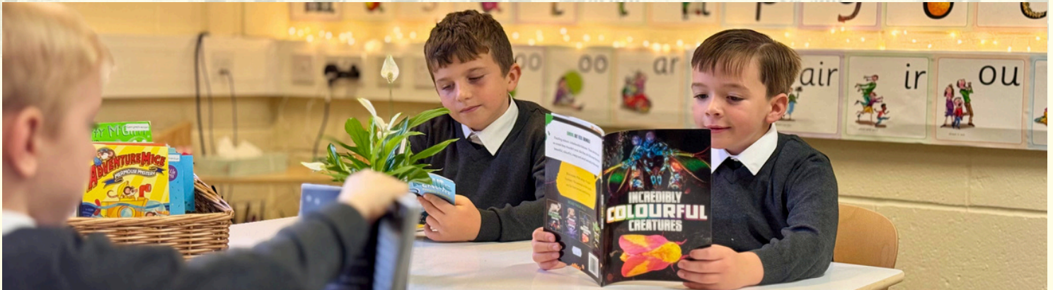
Our new Library is NOW open!