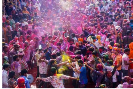
Festival of Holi