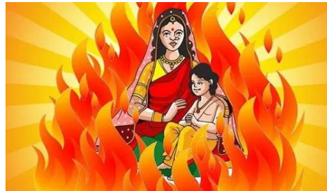
Story of Prahlad and Holika