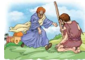
The Parable of the Lost Son