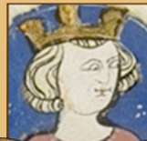
William, Duke of Normandy