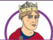
William the Conqueror