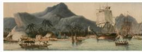
HMS Resolution and HMS Discovery

In 1776, Captain Cook went on his final voyage. He sailed on the HMS Resolution again and the HMS Discovery travelled with him. He was looking for a route between the Atlantic and Pacific Oceans. He visited the Hawaiian Islands, where he was killed.