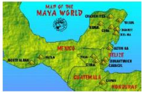
This map shows the modern countries that the Maya once occupied, as well as the locations of the key Maya cities.

What was daily life like? Ordinary Maya citizens lived in one room houses built from mud and timber. Men were responsible for providing for their families, women would prepare food and clothes and the children would learn these skills from their parents. Maya people would eat meat as well as their own grown crops, but maize was their staple food. The cacao bean was used to make a drink for the ruling classes.