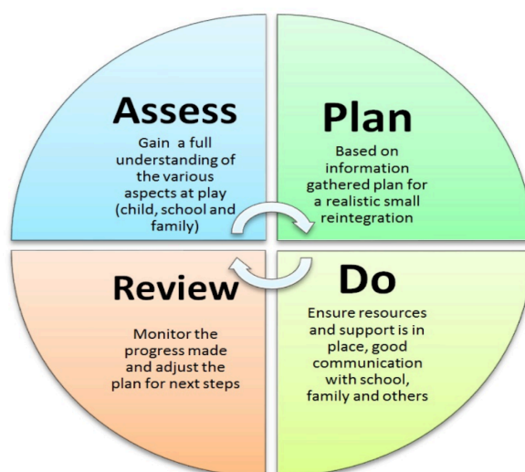
Figure 2: Assess, Plan, Do and Review Cycle (APDR)

FCAT academies follow the Assess-Plan-Do Review cycle to monitor the impact of interventions, helping staff develop a growing understanding of pupil’s needs and effective ways to support pupils.