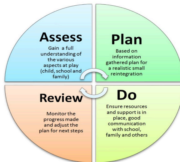
Figure 2: Assess, Plan, Do and Review Cycle (APDR)

FCAT academies follow the Assess-Plan-Do Review cycle to monitor the impact of interventions, helping staff develop a growing understanding of pupil’s needs and effective ways to support pupils.