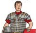
The Romans invade Britain - Iron Age ends.