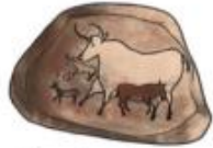
People make cave paintings.