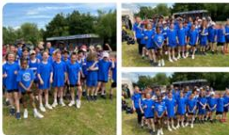
18:35 · 15 Jun 22 · Twitter for iPhone

Well done to our amazing Area Sports Athletics team who were fantastic today! We came 3rd overall 🏆 with our track team finishing 2nd overall 🏆. A huge thank you to all who competed and all parents/carers for your support too! Well done Team Boldmere! 🏃🏃🏃