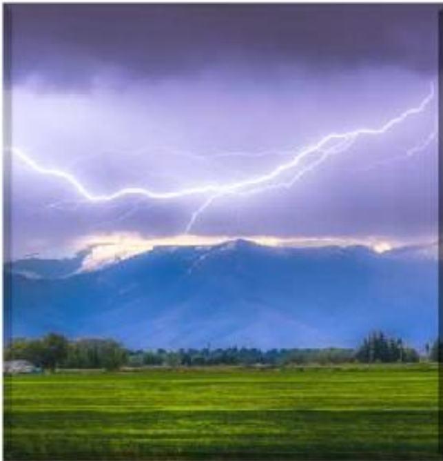
Pictured: Snow-capped hills in Colorado during a snowstorm

An unusual phenomenon known as 'thundersnow' has been observed in the UK and other countries situated in the northern hemisphere during the recent wintery weather. Thundersnow occurs when thunder and lightning mix with heavy snowstorms, causing loud claps that sound like explosions in the sky. These have not been the only unusual flashes of light to be observed in January 2021. In the Pacific Ocean, close to the small island of Nauru, blue jets of light have been spotted by astronauts on the International Space Station (ISS). Lightning can often be seen from ISS, which orbits the Earth far up in space at an altitude of 350 kilometres. But these strange blue jets strike upwards instead of downwards, sometimes as far up as 50 kilometres from the Earth's surface into the stratosphere. The stratosphere is the second layer of the Earth's atmosphere, where air is much thinner and calmer.