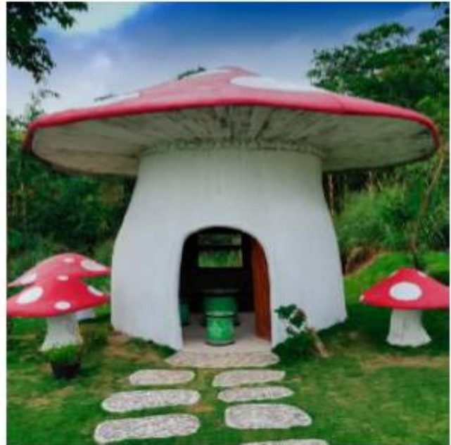
Pictured: Hobbiton is a popular New Zealand tourist destination

Governments around the world have been urging tourists to enjoy a holiday in their own country this summer, sometimes referred to as a 'staycation'. The tourists of New Zealand (NZ) are being urged to do the same. But the country's tourist board has taken it one step further with a funny advert by a famous comedian, Tom Sainsbury. Thousands of tourists post the same views of their trip on social media such as photos of a 'summit spreadeagle' where they photograph each other at the top of Mount Cook with their arms flung wide. NZ's tourist agency has said that this is boring and lacks imagination, so they are offering a travel voucher worth 500 NZ dollars to the winner of a competition on Twitter, using the hashtag #DoSomethingNewNZ, for more exciting photos of tourists posing at less well-known destinations across the country. If you were in NZ, what would yours be?