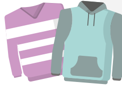
3 x Long Sleeve Tops (Jumpers/Hoodies etc)