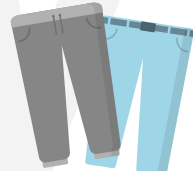
3 x Trousers (Ideally not jeans)