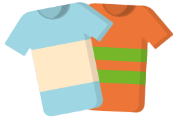
3 x T-Shirts (No vests or crop tops please)

(This list includes what you'll wear to Robinwood)