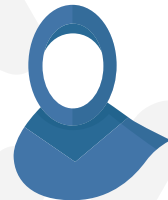
1 x spare Head Scarf (if you wear one)