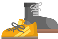
2 x Pairs of trainers