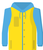
1 x Coat - ideally waterproof (For walking to centre)