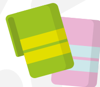
2 x Towels