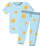
1 x Set of pyjamas