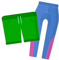
2 x Pair of shorts (knee length) (or leggings that can get wet)