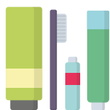
1 x Bag of toiletries (No aerosols please)