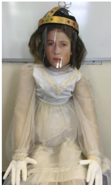
A sneak preview of one of the scarecrows!

Each child will be asked to decorate a paper plate on Wednesday, take it home and then bring it in on their party day with a suitable snack for the party. If plates are named and then covered in cling film/tin-foil it will help to ensure that each child only eats their own food and minimises any risk of allergies/food intolerances.