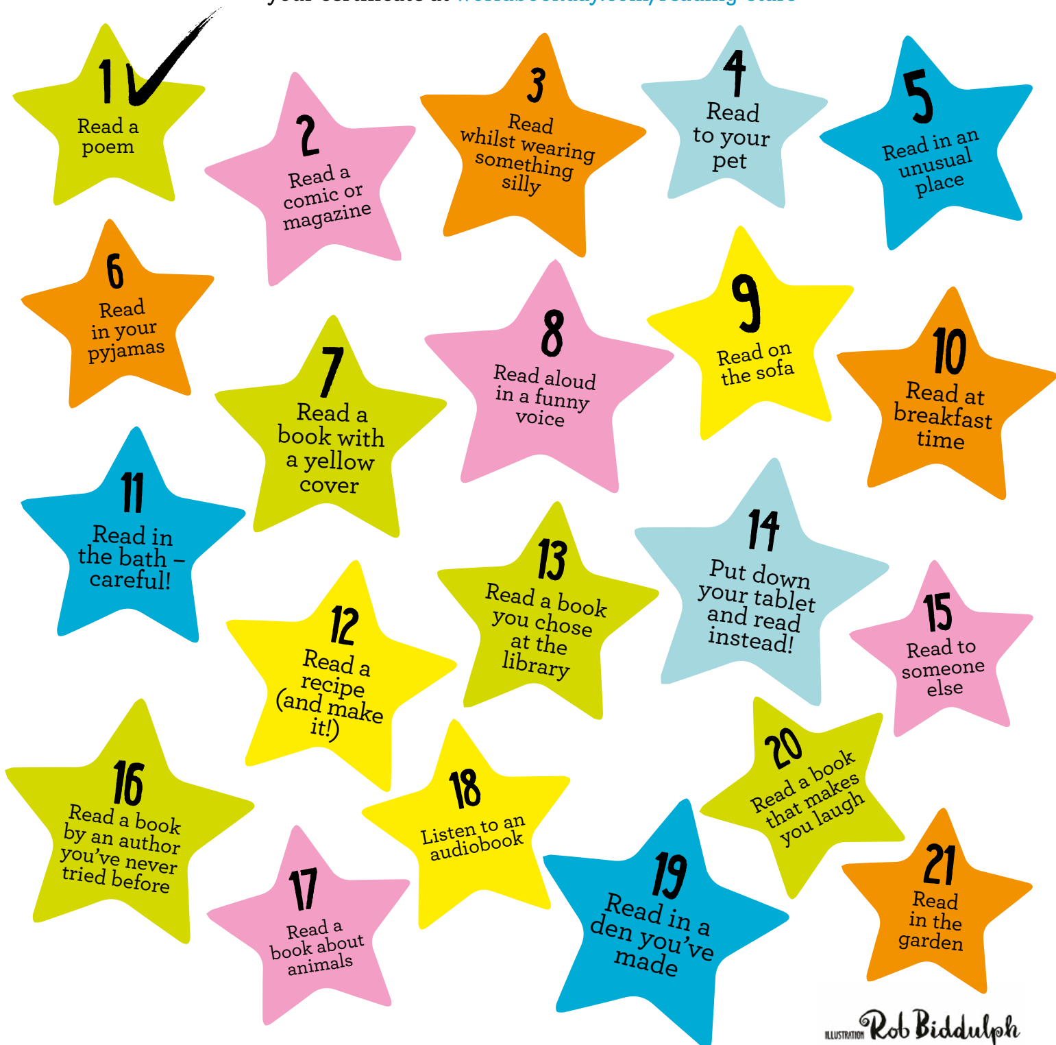
ILLUSTRATION Rob Biddulph

Tick off a Reading Star each time you complete a reading task and have fun reaching all your stars! You can also play the game online and download your certificate at worldbookday.com/reading-stars